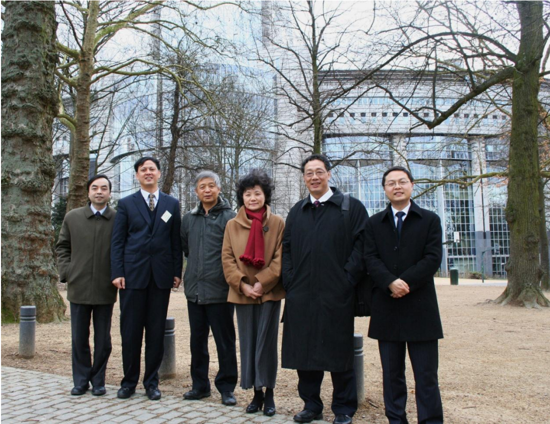
Group Photo after the March 8 Roundtable in Brussels

http://www.friendsofeurope.org/Contentnavigation/Events/Eventsoverview/tabid/1187/EventType/EventView/EventId/1117/EventDateID/1124/PageID/5601/GreeningChinascitiesoftomorrow.aspx